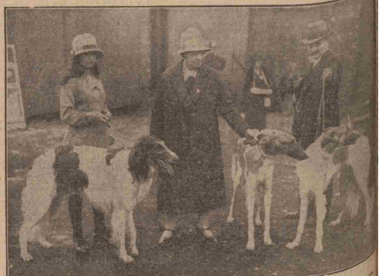
RUSSIAN DOG BEAUTIES.—Three handsome Borzois at the Leeds Dog Show. There were seven champions for this aristocratic breed.