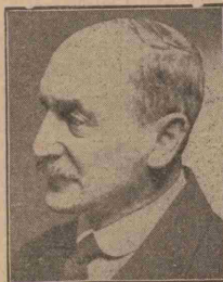
THE CAMOUFLAGE INVENTOR.—Mr. Solomon J. Solomon, R.A., who died yesterday. He introduced camouflage to the Allies during the war.