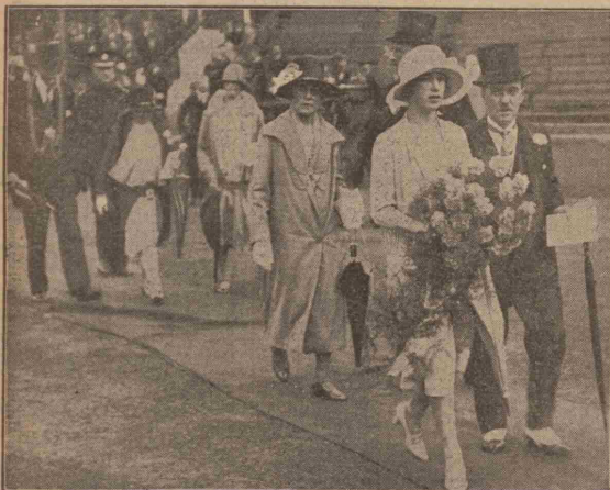
PRINCESS MARY AT A LEEDS GARDEN PARTY.—Princess Mary escorted by Sir Edwin Airey on her arrival at the garden party at the Headingley cricket ground in aid of the Children's Palace scheme for the poor children of the city. Behind are Lord Lascelles and the Lord Mayor and Lady Mayoress.