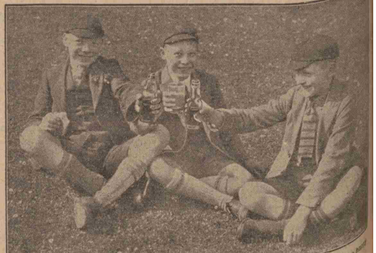
HERE'S TO A GOOD HOLIDAY.—The schools have closed for the summer holidays. Here are three boys celebrating their freedom.